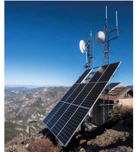
Remote Telecom Stations