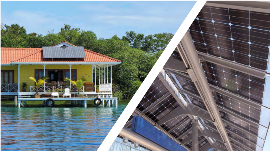
Residential Installations, Off-Grid Power Systems