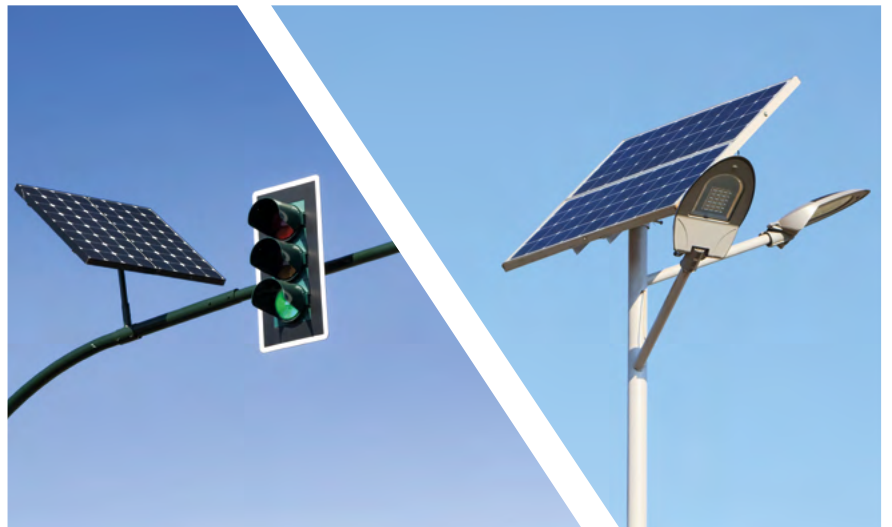
Traffic Signal Systems