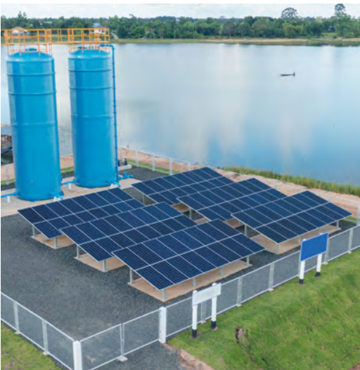
Water Pumping Systems